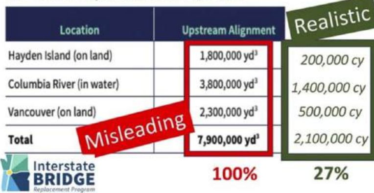
Table 1. Preliminary Tunnel Excavation Quantities

Ridiculous and misleading quantities that require 200' excavations & dredge depths of 80'. Realistic quantities are 1/4 as large and costly.